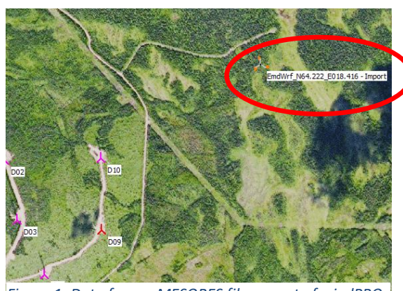
Figure 1: Data from a MESORES file as part of windPRO.

Over the last releases of windPRO, EMD has implemented several open-data interchange formats to facilitate easy interaction with 3<sup>rd</sup> party tools and own internal models - such as CFD-models [1, 2], optimization models [3] and wind atlas and climate data [4]. This document describes the MESORES format, an open and accessible results output-format for